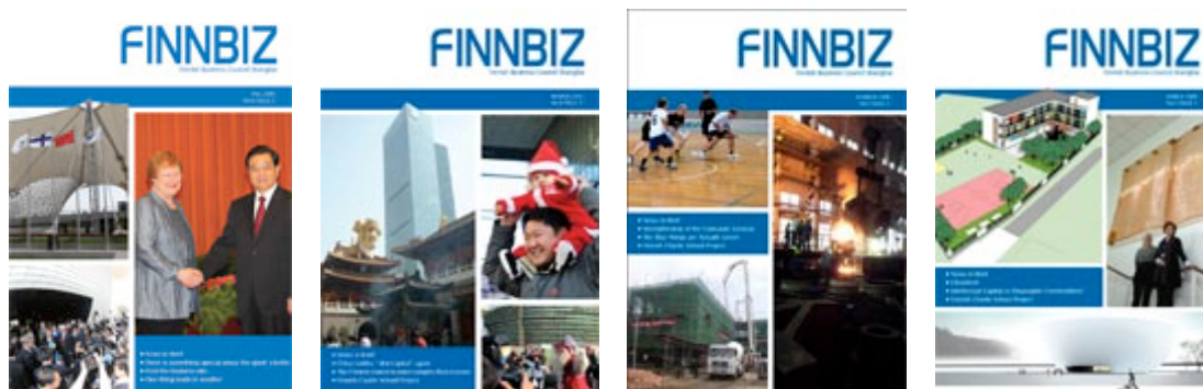
The cover pages of the last four FinnBiz issues published.

PDF versions of all FinnBiz newsletters can be downloaded at www.fbc.fi/finnbiz.php